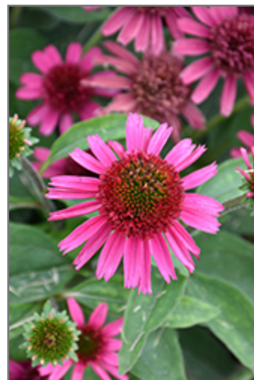
Delicious Candy Coneflower flowers

This is a relatively low maintenance plant, and is best cleaned up in early spring before it resumes active growth for the season. It is a good choice for attracting butterflies to your yard, but is not particularly attractive to deer who tend to leave it alone in favor of tastier treats. It has no significant negative characteristics.