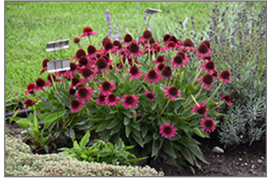
Delicious Candy Coneflower in bloom

Delicious Candy Coneflower is a fine choice for the garden, but it is also a good selection for planting in outdoor pots and containers. With its upright habit of growth, it is best suited for use as a 'thriller' in the 'spiller-thriller-filler' container combination; plant it near the center of the pot, surrounded by smaller plants and those that spill over the edges. Note that when growing plants in outdoor containers and baskets, they may require more frequent waterings than they would in the yard or garden. Be aware that in our climate, most plants cannot be expected to survive the winter if left in containers outdoors, and this plant is no exception. Contact our experts for more information on how to protect it over the winter months.