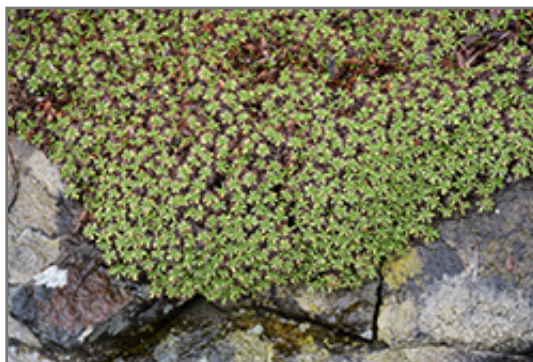
Cushion Bolax

Cushion Bolax is recommended for the following landscape applications;