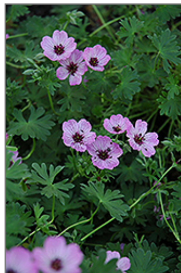
Ballerina Cranesbill flowers

Ballerina Cranesbill is recommended for the following landscape applications;