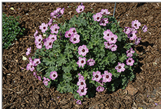
Ballerina Cranesbill flowers