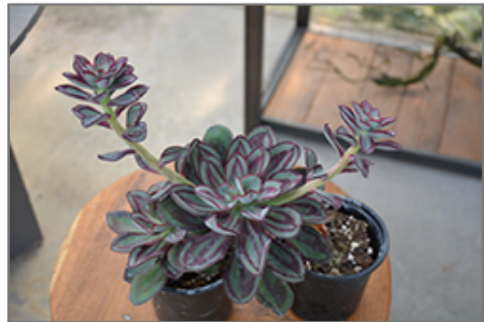
Painted Echeveria in full