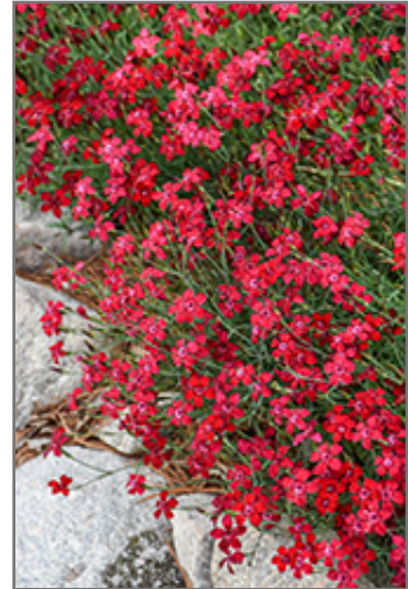
Flashing Light Maiden Pinks flowers

Flashing Light Maiden Pinks is recommended for the following landscape applications;