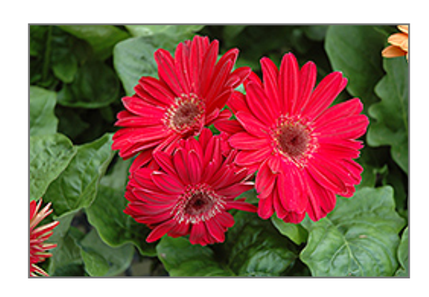
Fuchsia Gerbera Daisy flowers

When grown indoors, Fuchsia Gerbera Daisy can be expected to grow to be about 12 inches tall at maturity extending to 16 inches tall with the flowers, with a spread of 12 inches. It grows at a fast rate, and under ideal conditions can be expected to live for approximately 3 years. This houseplant will do well in a location that gets either direct or indirect sunlight, although it will usually require a more brightly-lit environment than what artificial indoor lighting alone can provide. It does best in average to evenly moist soil, but will not tolerate standing water. The surface of the soil shouldn't be allowed to dry out completely, and so you should expect to water this plant once and possibly even twice each week. Be aware that your particular watering schedule may vary depending on its location in the room, the pot size, plant size and other conditions; if in doubt, ask one of our experts in the store for advice. It is not particular as to soil type or pH; an average potting soil should work just fine.