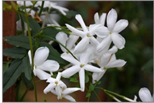
Climbing Jasmine flowers

This is a dense multi-stemmed evergreen houseplant with a spreading, ground-hugging habit of growth. This plant may benefit from an occasional pruning to look its best.