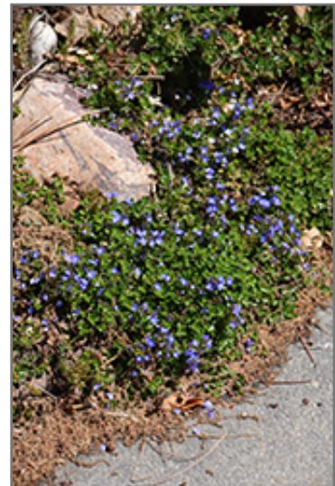
Turkish Speedwell in bloom