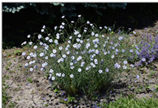
Blue Sapphire Perennial Flax in bloom

Blue Sapphire Perennial Flax is recommended for the following landscape applications;