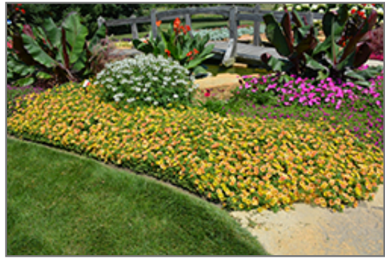
Supertunia Honey Petunia in bloom

Supertunia Honey Petunia will grow to be about 10 inches tall at maturity, with a spread of 24 inches. When grown in masses or used as a bedding plant, individual plants should be spaced approximately 20 inches apart. Its foliage tends to remain low and dense right to the ground. This fast-growing annual will normally live for one full growing season, needing replacement the following year.