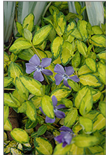
Illumination Periwinkle flowers

Illumination Periwinkle is a fine choice for the garden, but it is also a good selection for planting in outdoor pots and containers. Because of its spreading habit of growth, it is ideally suited for use as a 'spiller' in the 'spiller-thriller-filler' container combination; plant it near the edges where it can spill gracefully over the pot. Note that when growing plants in outdoor containers and baskets, they may require more frequent waterings than they would in the yard or garden. Be aware that in our climate, most plants cannot be expected to survive the winter if left in containers outdoors, and this plant is no exception. Contact our experts for more information on how to protect it over the winter months.