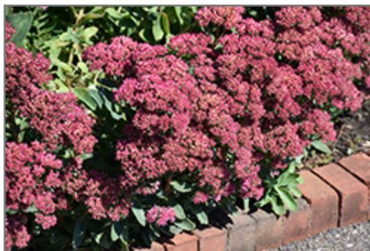
Carl Stonecrop in bloom

This is a relatively low maintenance plant, and is best cleaned up in early spring before it resumes active growth for the season. It is a good choice for attracting bees and butterflies to your yard, but is not particularly attractive to deer who tend to leave it alone in favor of tastier treats. It has no significant negative characteristics.