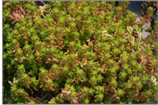
Jelly Bean Plant

Jelly Bean Plant is recommended for the following landscape applications;