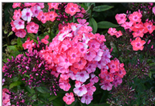
Garden Girls Glamour Girl Garden Phlox flowers

Garden Girls Glamour Girl Garden Phlox is recommended for the following landscape applications;