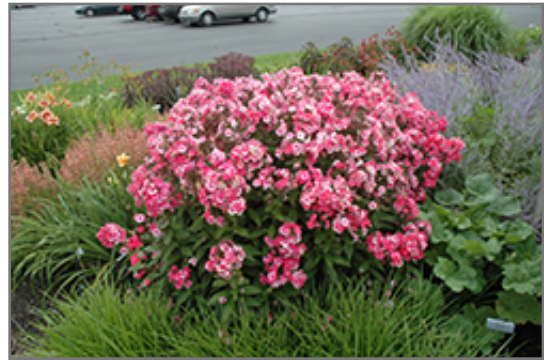
Garden Girls Glamour Girl Garden Phlox in bloom

Garden Girls Glamour Girl Garden Phlox will grow to be about 28 inches tall at maturity, with a spread of 24 inches. When grown in masses or used as a bedding plant, individual plants should be spaced approximately 18 inches apart. It grows at a medium rate, and under ideal conditions can be expected to live for approximately 10 years. As an herbaceous perennial, this plant will usually die back to the crown each winter, and will regrow from the base each spring. Be careful not to disturb the crown in late winter when it may not be readily seen!