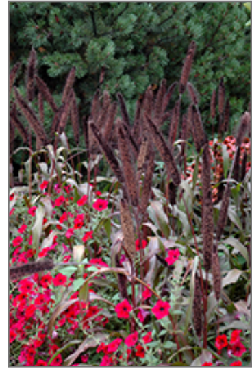
Purple Baron Millet in bloom

Purple Baron Millet is recommended for the following landscape applications;