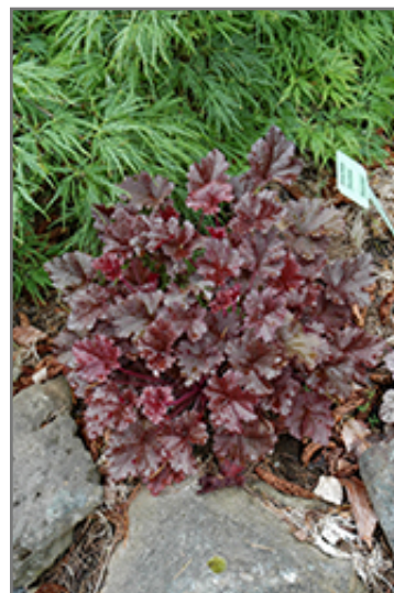
Dark Secret Coral Bells

Dark Secret Coral Bells is recommended for the following landscape applications;