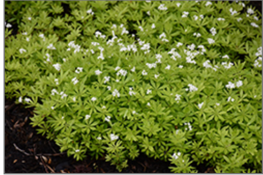
Sweet Woodruff in bloom

This plant does best in partial shade to shade. It prefers to grow in average to moist conditions, and shouldn't be allowed to dry out. It is not particular as to soil type, but has a definite preference for acidic soils. It is somewhat tolerant of urban pollution. This species is not originally from North America. It can be propagated by division.