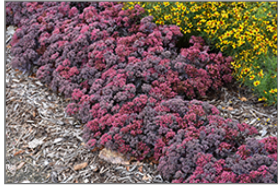
Dazzleberry Stonecrop in bloom

Dazzleberry Stonecrop is a fine choice for the garden, but it is also a good selection for planting in outdoor pots and containers. It is often used as a 'filler' in the 'spiller-thriller-filler' container combination, providing a mass of flowers and foliage against which the larger thriller plants stand out. Note that when growing plants in outdoor containers and baskets, they may require more frequent waterings than they would in the yard or garden. Be aware that in our climate, most plants cannot be expected to survive the winter if left in containers outdoors, and this plant is no exception. Contact our experts for more information on how to protect it over the winter months.