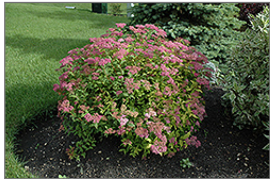
Goldflame Spirea in bloom