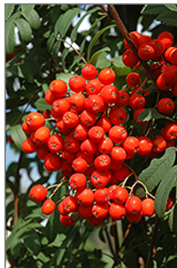
Pyramidal Mountain Ash fruit