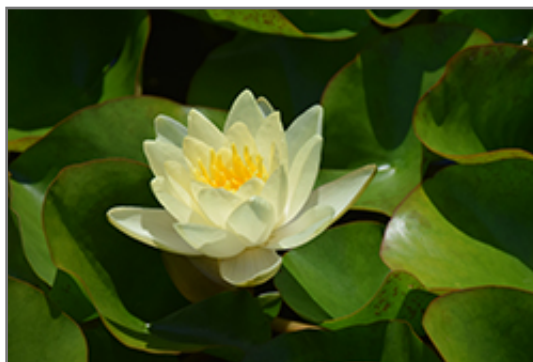
Marliacea Chromatella Hardy Water Lily flowers