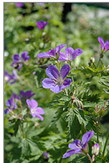
Mayflower Wood Cranesbill flowers