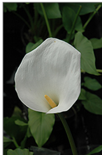
Calla Lily flowers

Calla Lily is recommended for the following landscape applications;