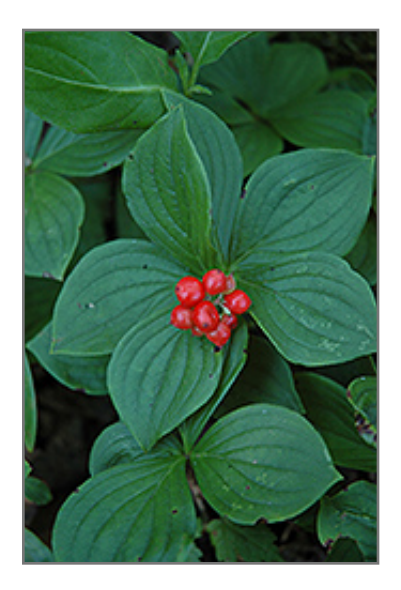
Bunchberry fruit