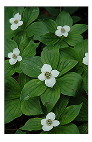
Bunchberry flowers