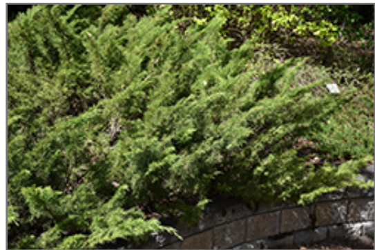
Scandia Juniper