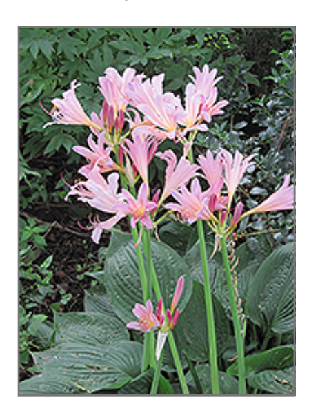
Surprise Lily in bloom