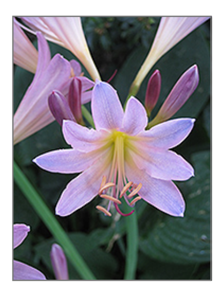
Surprise Lily flowers

Surprise Lily is recommended for the following landscape applications;