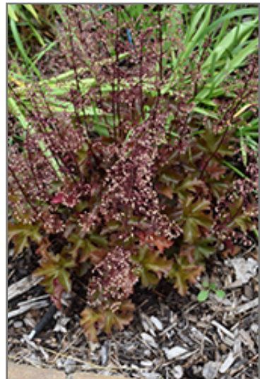
Melting Fire Coral Bells in bloom