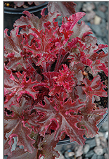
Melting Fire Coral Bells foliage

Melting Fire Coral Bells is recommended for the following landscape applications;