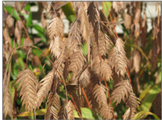
Northern Sea Oats fruit

Northern Sea Oats is a fine choice for the garden, but it is also a good selection for planting in outdoor pots and containers. Because of its height, it is often used as a 'thriller' in the 'spiller-thriller-filler' container combination; plant it near the center of the pot, surrounded by smaller plants and those that spill over the edges. It is even sizeable enough that it can be grown alone in a suitable container. Note that when growing plants in outdoor containers and baskets, they may require more frequent waterings than they would in the yard or garden. Be aware that in our climate, most plants cannot be expected to survive the winter if left in containers outdoors, and this plant is no exception. Contact our experts for more information on how to protect it over the winter months.