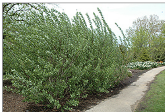
Marquette French Pussy Willow