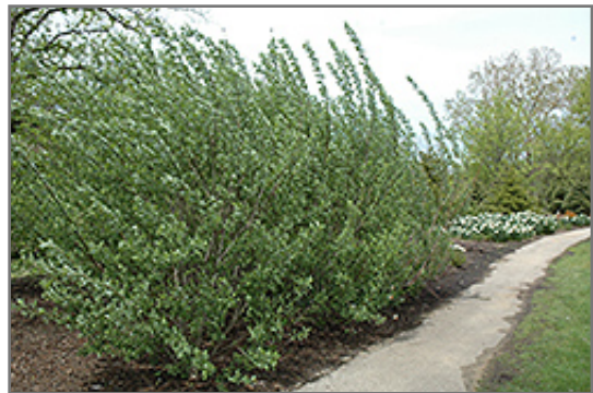
Marquette French Pussy Willow