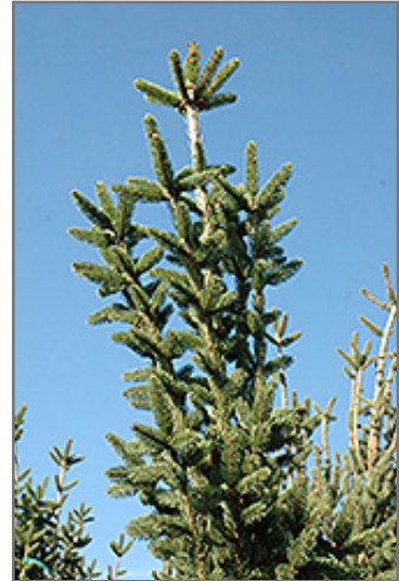
Columnar Norway Spruce foliage