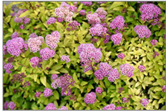
Sundrop Spiraea flowers

Sundrop Spiraea is recommended for the following landscape applications;