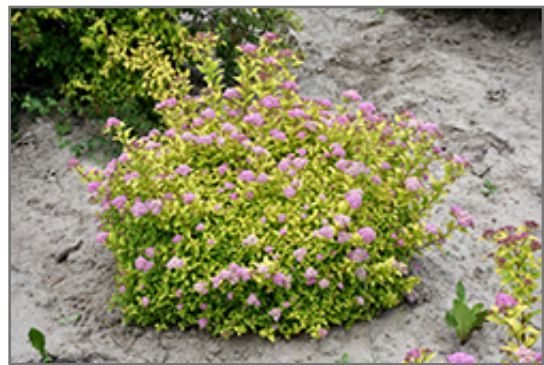
Sundrop Spiraea in bloom