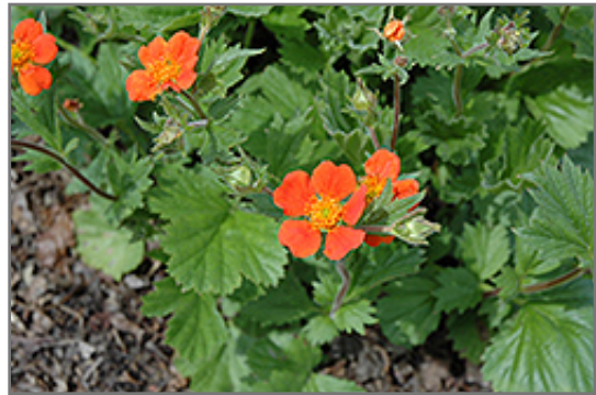
Boris Avens flowers

Boris Avens is recommended for the following landscape applications;