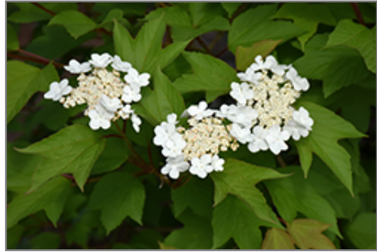
Redwing Highbush Cranberry flowers

Redwing Highbush Cranberry is a dense multi-stemmed deciduous shrub with an upright spreading habit of growth. Its average texture blends into the landscape, but can be balanced by one or two finer or coarser trees or shrubs for an effective composition.