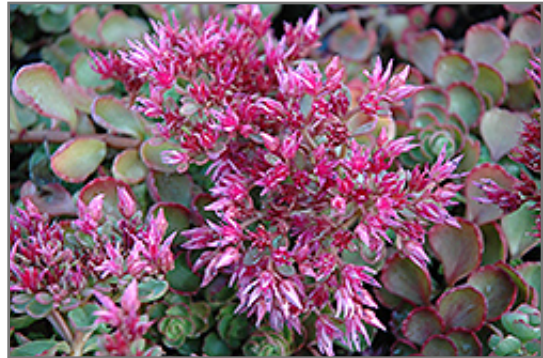
Fulda Glow Stonecrop flowers