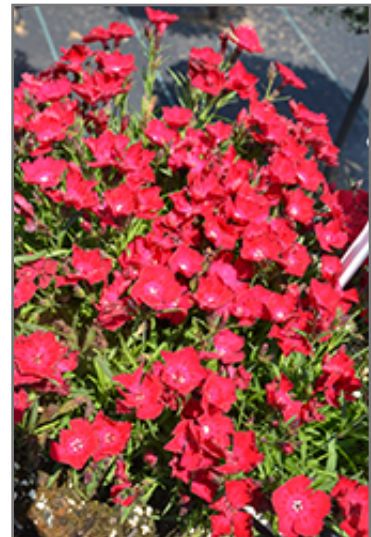
Beauties Tyra Pinks flowers