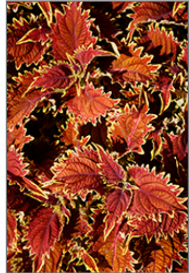
Copperhead Coleus foliage