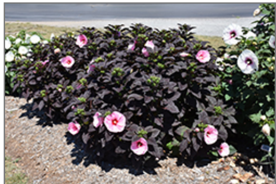
Summerific Edge of Night Hibiscus in bloom