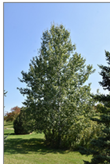
Quaking Aspen