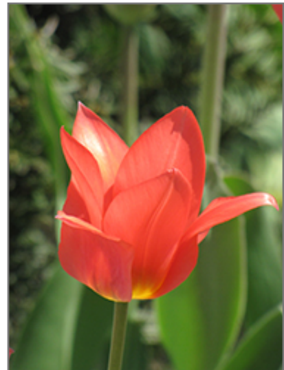
Red Emperor Tulip flowers