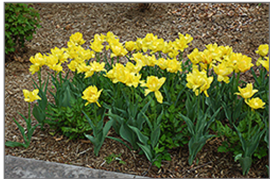
Monte Carlo Tulip in bloom