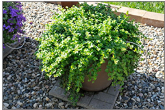
Indian Mint