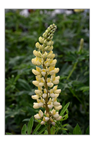
Chandelier Lupine flowers

A vivid, gorgeous selection, producing thick spikes of eye catching blooms in shades of yellow and cream; a tremendous visual impact massed in the garden, border plantings or in containers