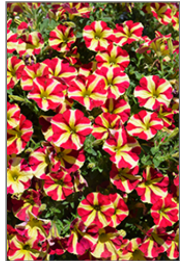
Amore Queen of Hearts Petunia flowers

This plant will require occasional maintenance and upkeep. Trim off the flower heads after they fade and die to encourage more blooms late into the season. It is a good choice for attracting butterflies and hummingbirds to your yard, but is not particularly attractive to deer who tend to leave it alone in favor of tastier treats. It has no significant negative characteristics.