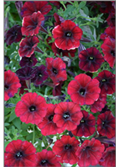
Supertunia Black Cherry Petunia flowers

Supertunia Black Cherry Petunia is a dense herbaceous annual with a trailing habit of growth, eventually spilling over the edges of hanging baskets and containers. Its medium texture blends into the garden, but can always be balanced by a couple of finer or coarser plants for an effective composition.