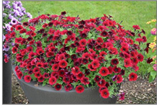
Supertunia Black Cherry Petunia in bloom