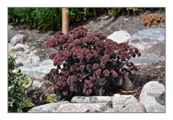
Night Embers Stonecrop in bloom

Night Embers Stonecrop is a dense herbaceous perennial with an upright spreading habit of growth. Its relatively coarse texture can be used to stand it apart from other garden plants with finer foliage.