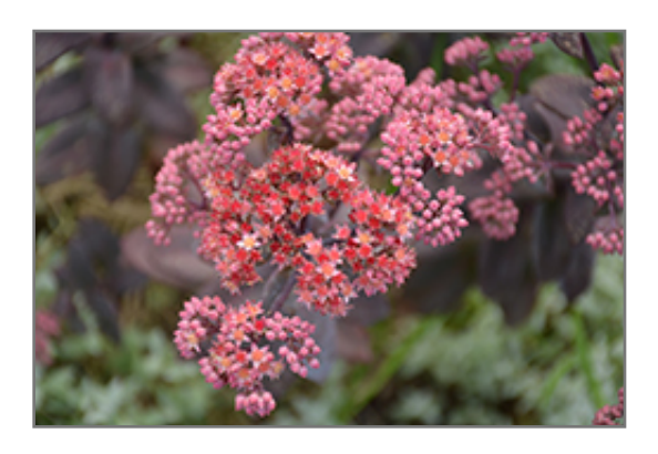
Night Embers Stonecrop flowers