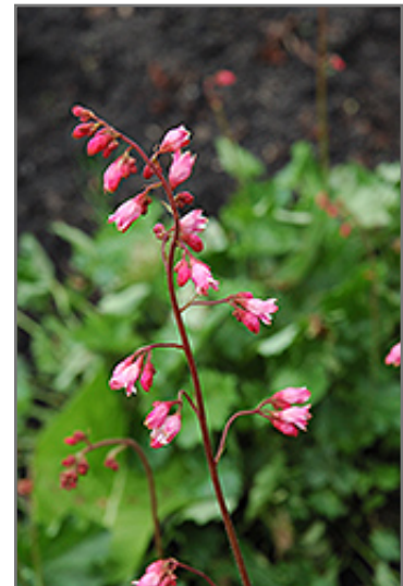
Brandon Pink Coral Bells flowers