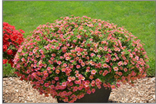
Superbells Tropical Sunrise Calibrachoa in bloom