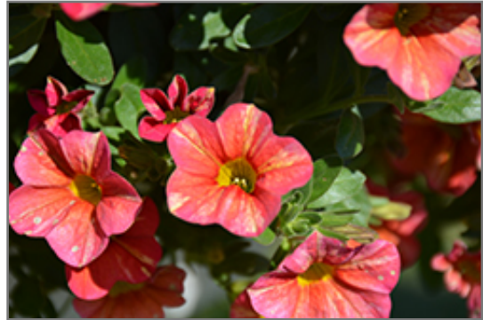
Superbells Tropical Sunrise Calibrachoa flowers

Superbells Tropical Sunrise Calibrachoa is a dense herbaceous annual with a trailing habit of growth, eventually spilling over the edges of hanging baskets and containers. Its medium texture blends into the garden, but can always be balanced by a couple of finer or coarser plants for an effective composition.