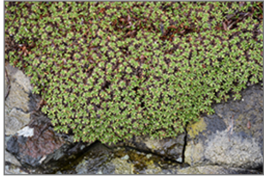
Cushion Bolax

Cushion Bolax is recommended for the following landscape applications;