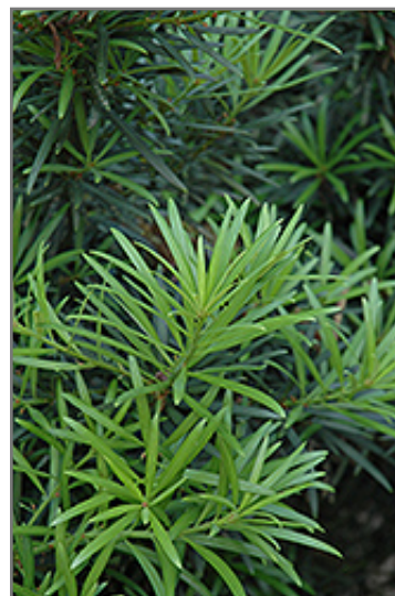
Buddhist Pine foliage

When grown indoors, Buddhist Pine can be expected to grow to be about 6 feet tall at maturity, with a spread of 3 feet. It grows at a slow rate, and under ideal conditions can be expected to live for approximately 50 years. This houseplant will do well in a location that gets either direct or indirect sunlight, although it will usually require a more brightly-lit environment than what artificial indoor lighting alone can provide. It does best in average to evenly moist soil, but will not tolerate standing water. The surface of the soil shouldn't be allowed to dry out completely, and so you should expect to water this plant once and possibly even twice each week. Be aware that your particular watering schedule may vary depending on its location in the room, the pot size, plant size and other conditions; if in doubt, ask one of our experts in the store for advice. It is not particular as to soil type or pH; an average potting soil should work just fine.