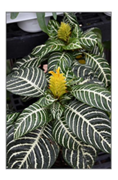
Zebra Plant in bloom

When grown indoors, Zebra Plant can be expected to grow to be about 24 inches tall at maturity extending to 3 feet tall with the flowers, with a spread of 24 inches. It grows at a medium rate, and under ideal conditions can be expected to live for approximately 10 years. This houseplant should only be grown away from direct sunlight or in a room with strong artificial light. It prefers to grow in average to moist soil. The surface of the soil shouldn't be allowed to dry out completely, and so you should expect to water this plant once and possibly even twice each week. Be aware that your particular watering schedule may vary depending on its location in the room, the pot size, plant size and other conditions; if in doubt, ask one of our experts in the store for advice. It is not particular as to soil type or pH; an average potting soil should work just fine.